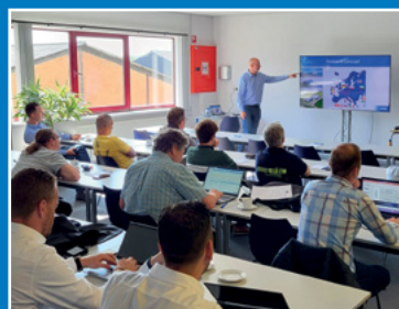
Trainingen en seminars